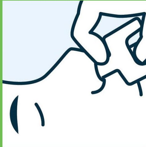
Insert tip into either nostril